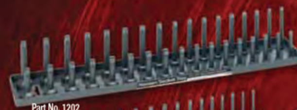
Part No. 1202

4, 4.5, 5, 5.5, 6, 7, 8, 9, 10, 11, 12, 13, 14 & 15mm