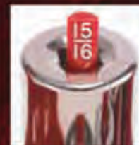
3/8" drive SAE tray features 15/16" posts for regular and deep well sockets

Trays come in SAE and Metric sizes for 1/2", 3/8" and 1/4" drives. Best selling 3/8" drive SAE and Metric trays hold sockets from 1/4" to 1" or from 6mm to 20mm. Trays are molded of rugged ABS plastic to shrug off gas, oil, bumps and hard knocks. Three SAE sizes in red and three Metric sizes in gray. Butterfly-type slot on bottom for pegboard display.