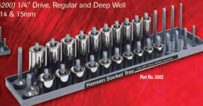
Part No. 3802