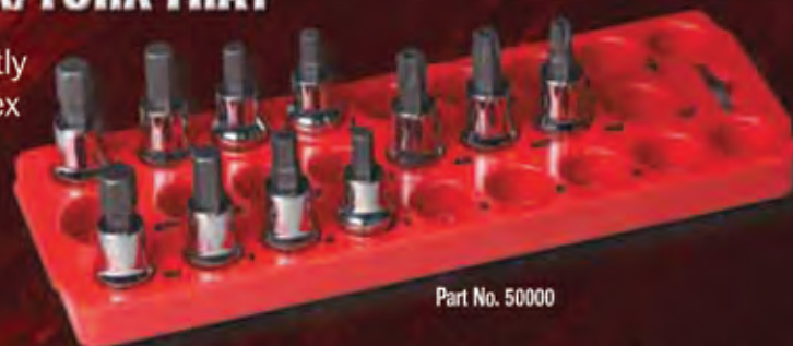
Part No. 50000

Tray is molded of tough ABS plastic to resist oil, grease and solvents. Sizes for each of the SAE, Metric and Torx sockets are pad printed in an oil and grease resistant black ink. Special end tangs on the 9-3/16" x 3-1/4" tray provide a finger hold for picking up tray in tight tool boxes.