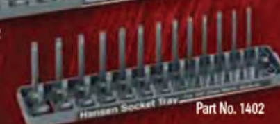
Part No. 1402